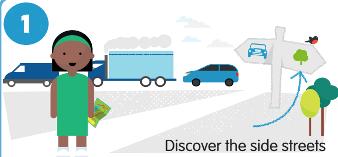
Discover the side streets

Air pollution can worsen asthma symptoms including coughing, wheezing and breathlessness. The actions below can help: