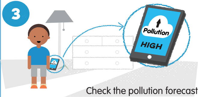
Check the pollution forecast

Encourage your whole family to walk, cycle and scoot more - air pollution can be higher inside a car than outside.