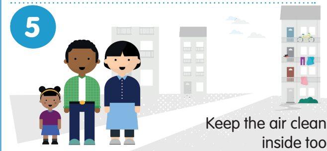
Keep the air clean inside too

If you do need to use a car, ask the driver to turn the engine off when the car isn't moving.