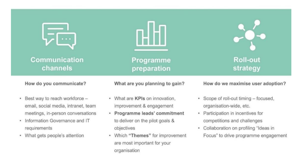
Figure A: UCLPartners ImproveWell pilot preparation

Working with your organisation on key questions for a successful launch